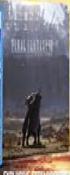
EXCLUSIVE MIDGAR BANGLE