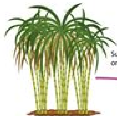
Sugar cane grown on farm.