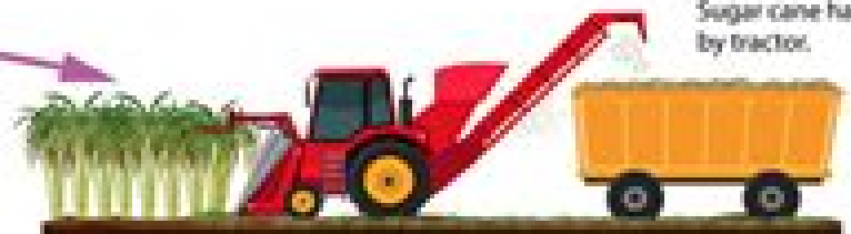
Sugar cane harvested by tractor.