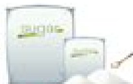
Sugar production and packaging.