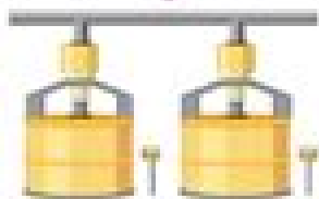
Separation via centrifuge.