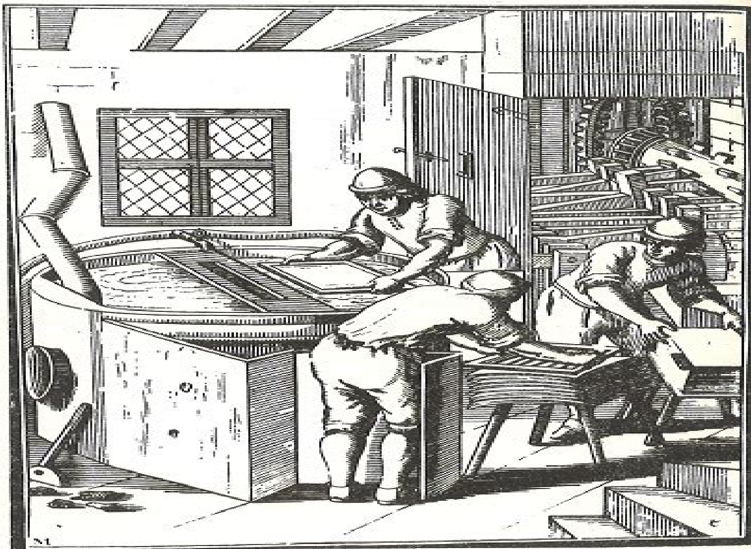
Early paper-making, circa seventeenth century