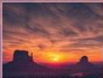
SUNSET, MONUMENT VALLEY, USA