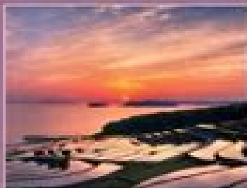
SUNSET, SHIRANEI BEACH, JAPAN