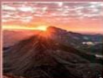
SUNSET, WESTERN PEARL, COLOMBIA, ISLAND