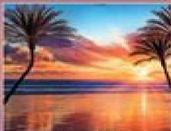
SUNSET, SAN DIEGO, CALIFORNIA