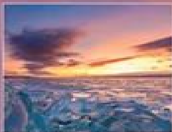
SUNSET, BAHAMAS, ISLAND