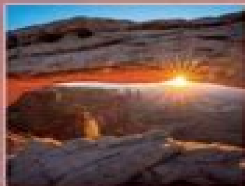
SUNRISE, WEST ARIZON, STATE, USA