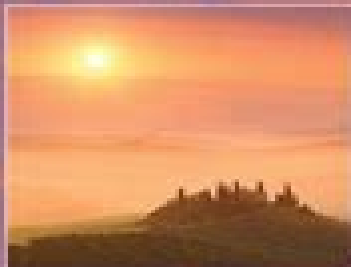
SUNRISE, NEW YORK, USA