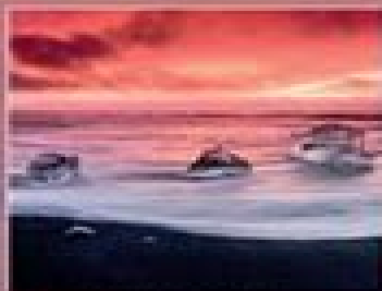
SUNSET, JONQUARIN, ISLAND