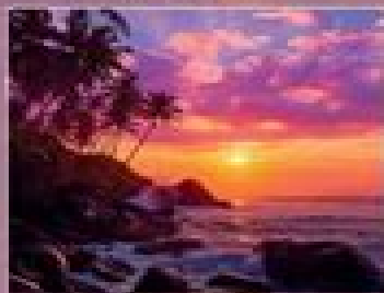
SUNSET, BEI LAKE, LA