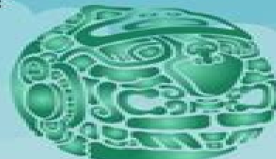
KINICH AHAU Mayan