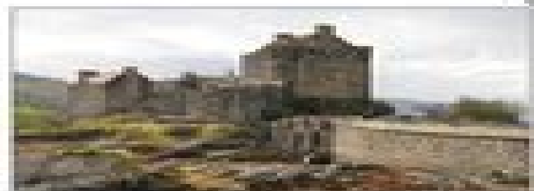
Eilean Donan Castle

In the 13th century, there were the Wars of Scottish Independence. In 1296, the king of England invaded Scotland and declared himself king, starting the First War. The war ended with a treaty signed in 1328, which allowed Scotland to stay free.