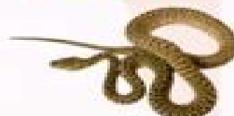
Torresian Carpet Python