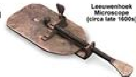
Leeuwenhoek Microscope (circa late 1600s)