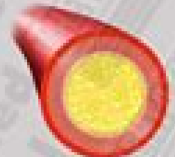
Left anterior descending artery 100% narrowing