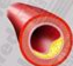
Left anterior descending artery 30% narrowing after angioplasty