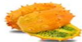
Horned Melon Fruit