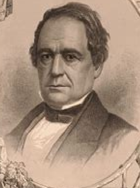
FOR VICE PRESIDENT HANNIBAL HAMLIN OF MAINE