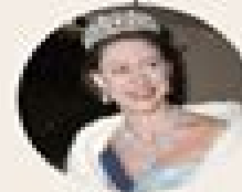
Princess Margaret Countess of Snowdon