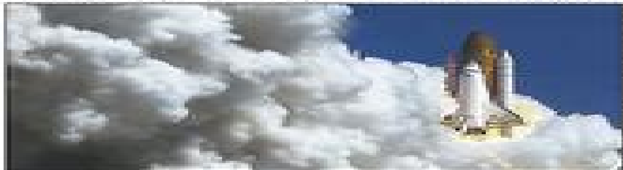
Space Shuttle Discovery is launched from the Kennedy Space Center in Florida. The shuttle is carrying the payload of the STS-51-L mission.

NASA on edge as Discovery lifts orbit; a piece of debris appears to break away