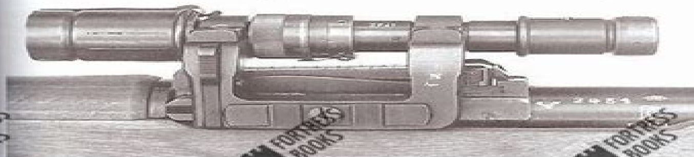
Abb. 1.27 Mauser: Linker und rechter Seitenansicht eines Gewehr 98k mit einem Fernglas. Der Gewehr 98k ist ein kürzeres Gewehr, das die gleiche Mechanik wie der Gewehr 98 hat, aber eine andere Form hat. Die Gewehr 98k ist ein kürzeres Gewehr, das die gleiche Mechanik wie der Gewehr 98 hat, aber eine andere Form hat.