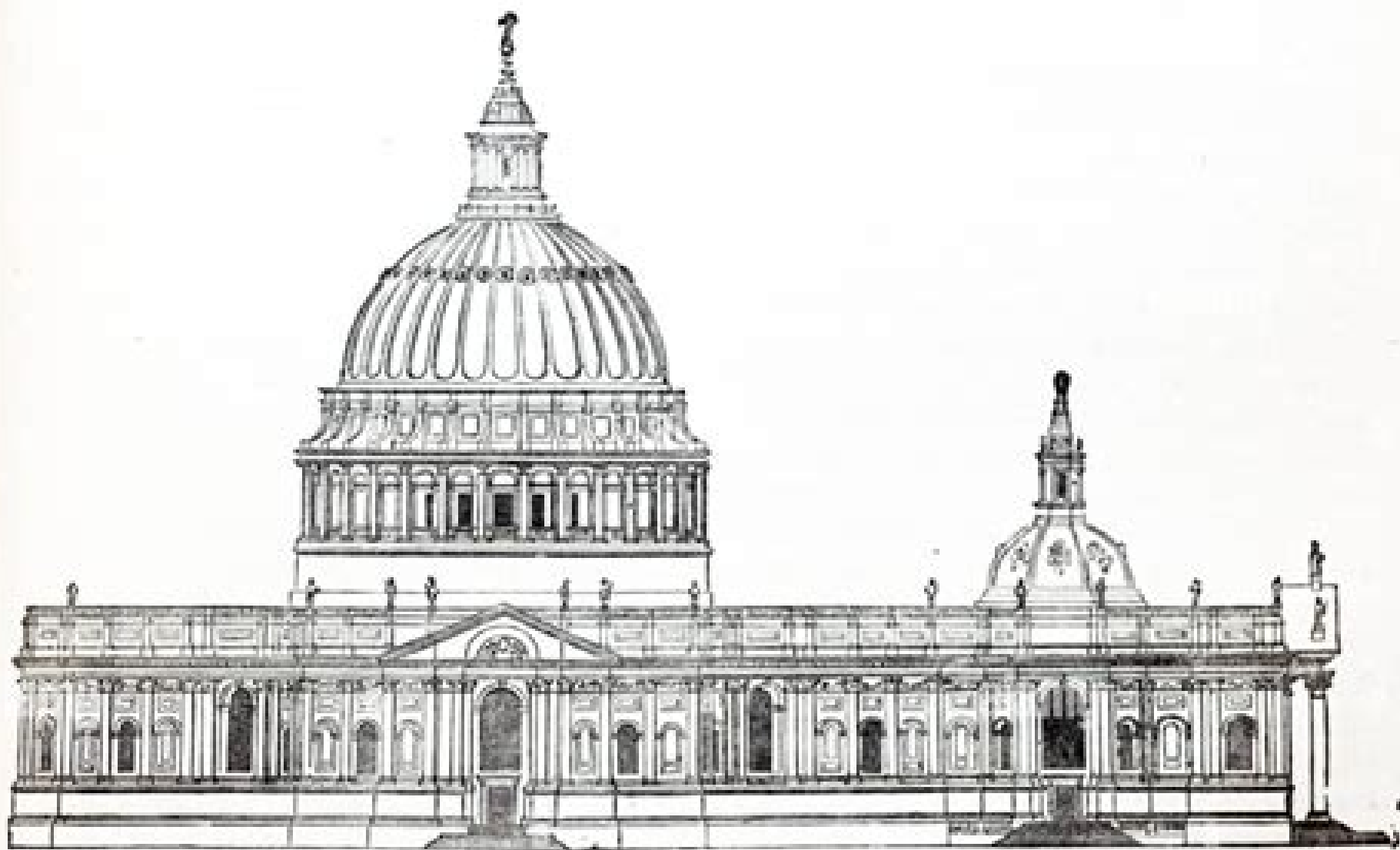
SIR CHRISTOPHER WREN'S FIRST DESIGN FOR ST. PAUL'S.