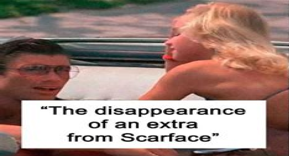
“The disappearance of an extra from Scarface”