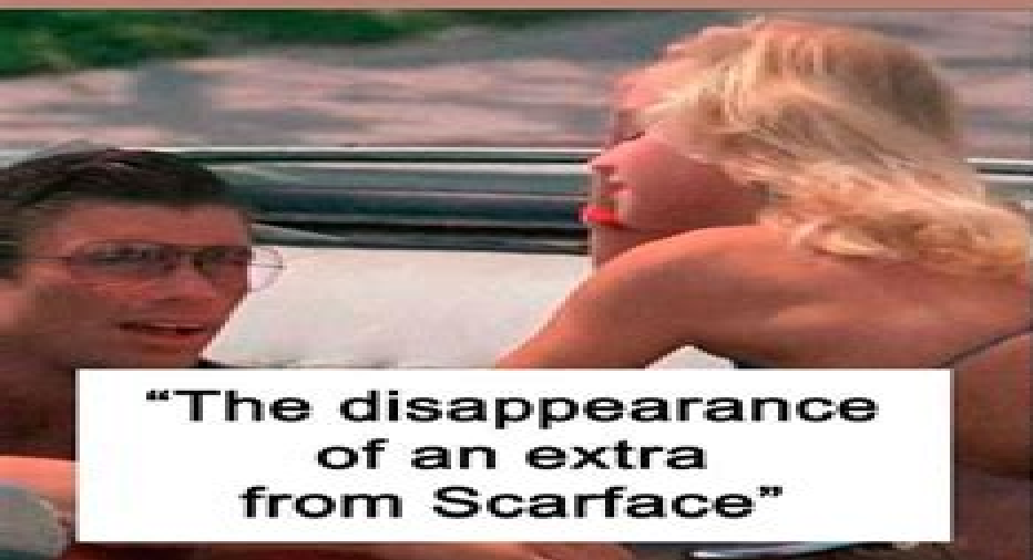
“The disappearance of an extra from Scarface”