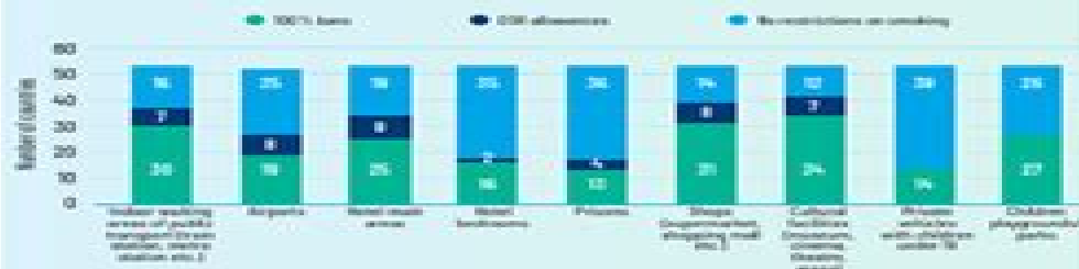
Fig. 3. Indoor and outdoor smoke-free venues in the WHO European Region, 2022

Note: Airports does not have an airport.