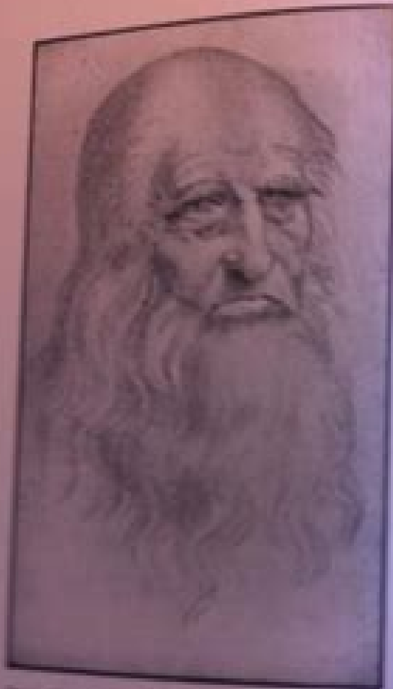
Engraving of Leonardo da Vinci's face, from the original drawing in the Library of the British Museum, London.