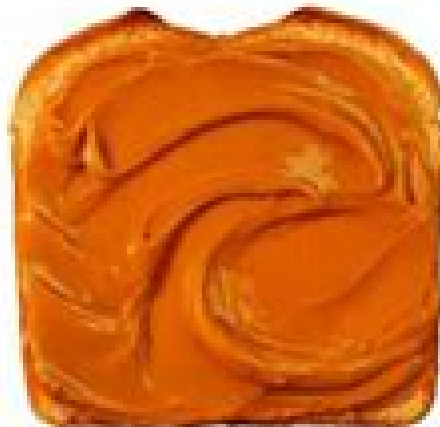
Peanut Butter on Toast