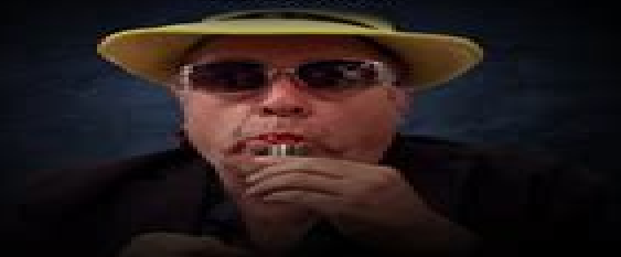
THE MAD MAN