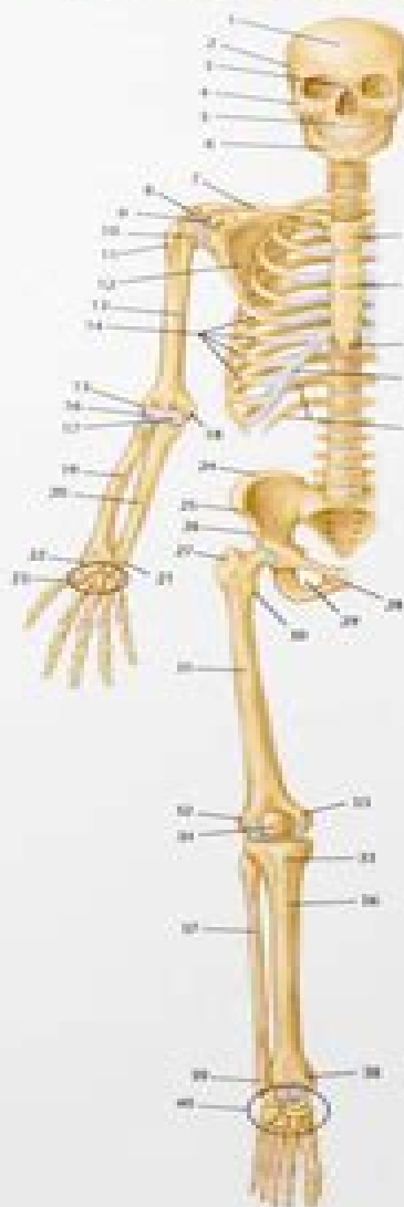
Figure 2: Skull & Vertebral Column (Lateral View)