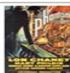
The Phantom of the Opera 1929

43005-8 Noble—Color Your Own Great Flower Paintings $3.95