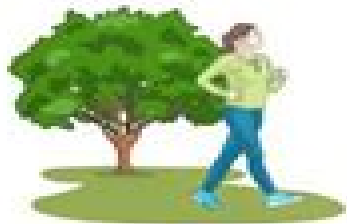
Regularly Spending Time In Nature