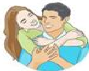
Spending Quality Time with Family/Friends