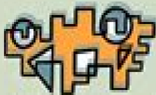
Disorganized speech and thoughts