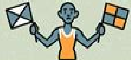
Inability to process social cues