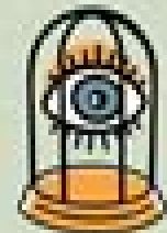
Impaired sensory perception