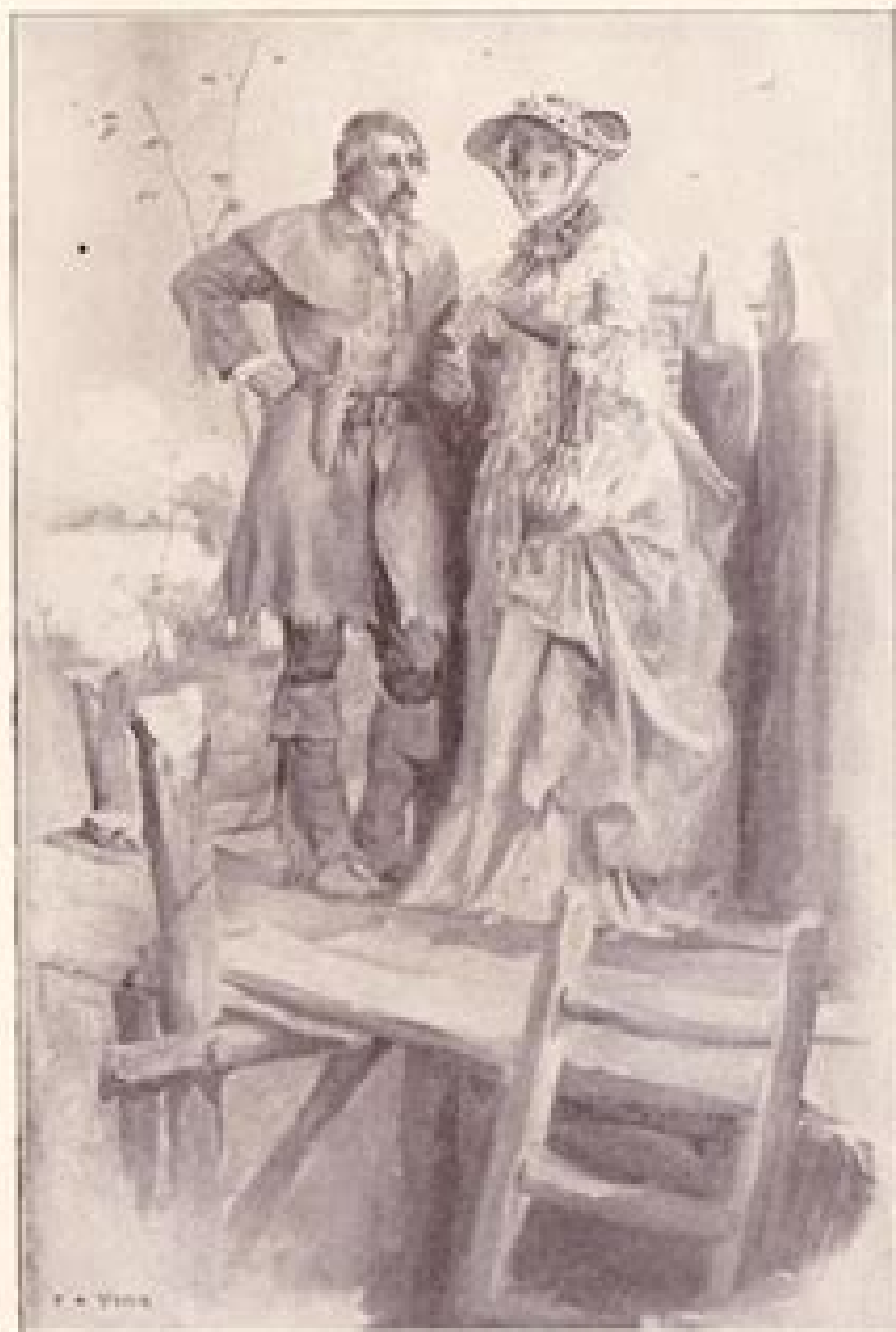
My eyes, hungry with love, were upon that face beside me. Page 401.