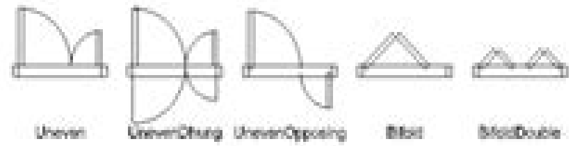
Unseen UnseenOpening UnseenOpposing Bifold BifoldDouble