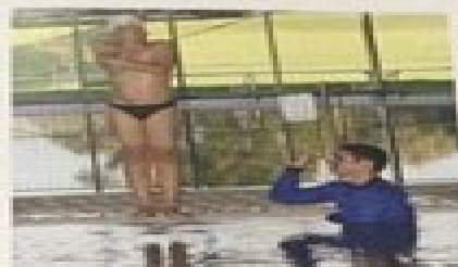
Compact jump (without a PFD) is performed in deep water.