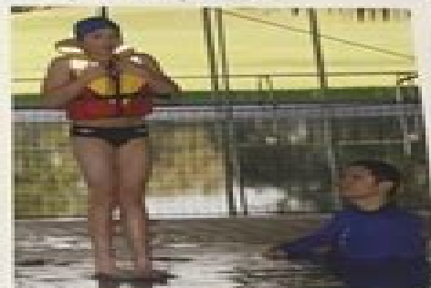
Compact jump with PFD (without a PFD) is performed in deep water.