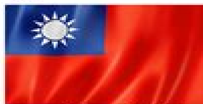
Republic of China