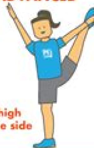
Leg high to the side