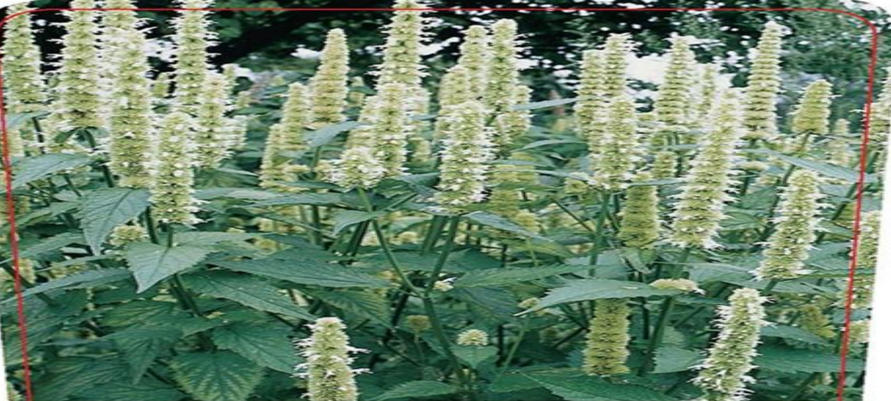
Agastache rugosa 'Alabaster'