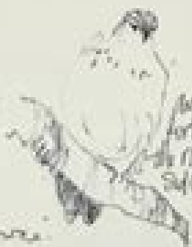
Another hawk in the area in the Sud Clark PARK