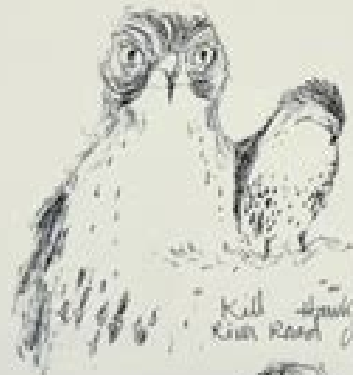
Kill stump near SEA Cedar Road, Arrowhead