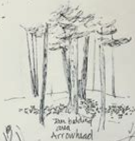
Man holding stick Arrowhead