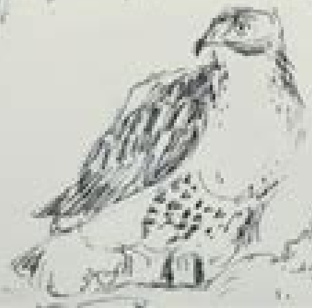
The hawk stayed by the Kill. Stopped to take berries and the called out. This hawk later the saw still there.