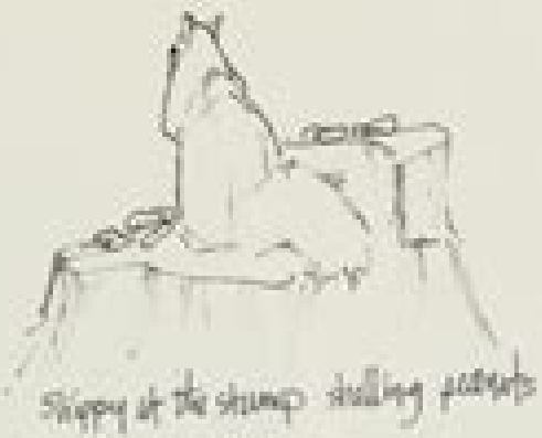
Slippy at the stump, skulking parents