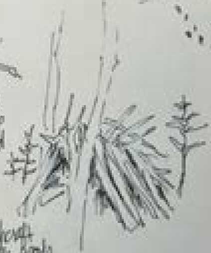
Backpack hut in the woods