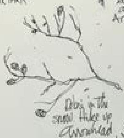
Down in the snow. Hike up Arrowhead