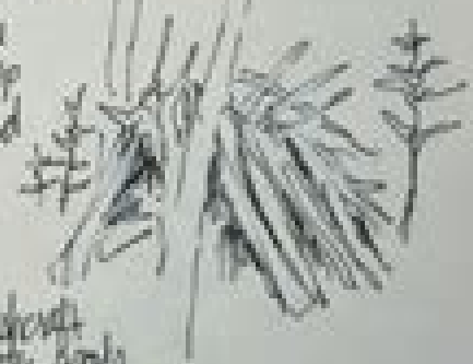
Backwards but in the middle