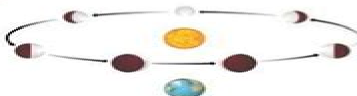
Phases of Venus