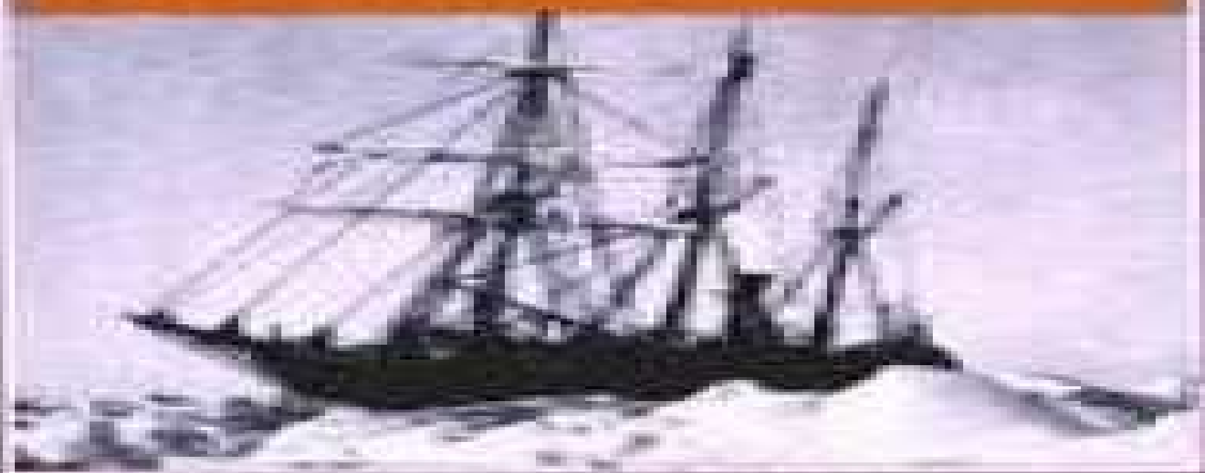
THE ENDURANCE, THE ADVENTURE