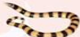
Jan's Banded Snake