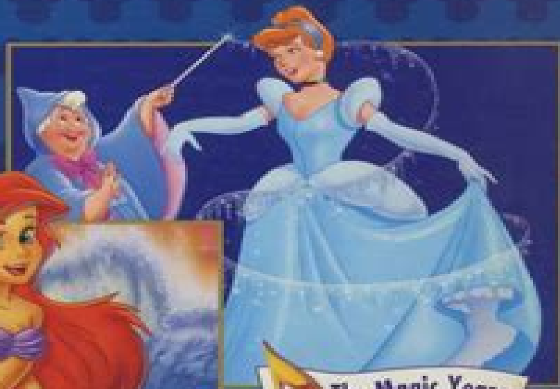
The Magic Years