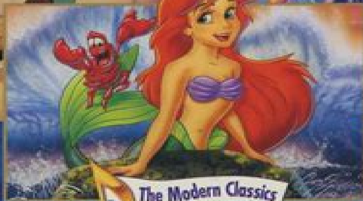
The Modern Classics

THE BEST SONGS FROM 65 YEARS OF CLASSIC Disney FILMS — FROM THREE LITTLE PIGS TO HERCULES !