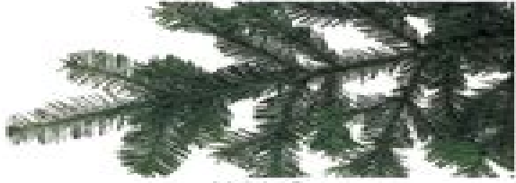
Noble fir Abies procera syn. A. nobilis