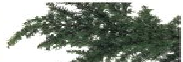
Mountain hemlock Tsuga mertensiana

(NOTE: Coniferous hemlock is not related to the poisonous herb Conium, which is also commonly known as hemlock.)