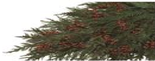
Coned cedar (Western red cedar) Thuja plicata