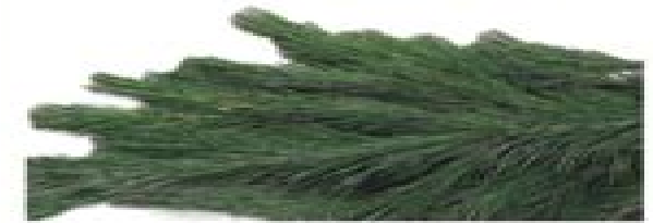
White pine Weymouth pine / Princess pine Pinus strobus