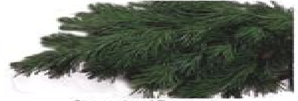
Shore pine / Beach pine Lodgepole pine Pinus contorta