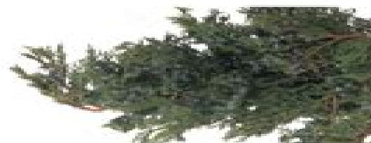
Juniper Juniperus communis