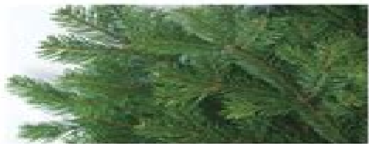
White fir Abies concolor