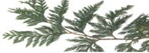
Western red cedar Thuja plicata