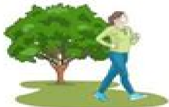
Regularly Spending Time In Nature