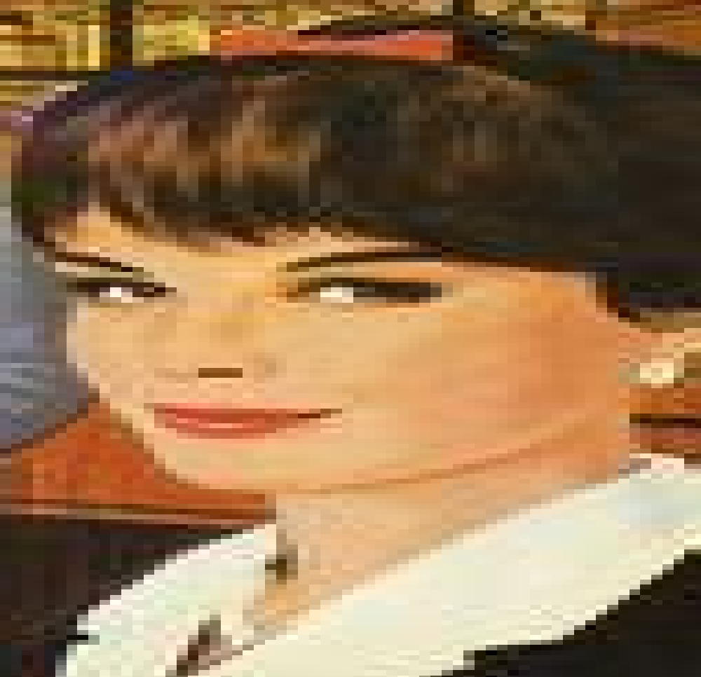
ILLUSTRATION BY [illegible]