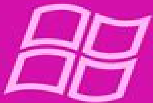
Microsoft 365 test