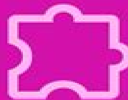
Problem Solving test