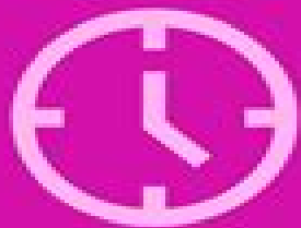
Time Management test