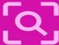
Attention to Textual Detail test