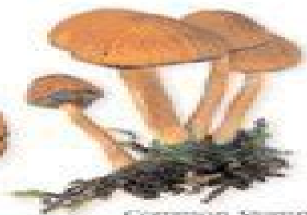
Common Stump Psathyrella