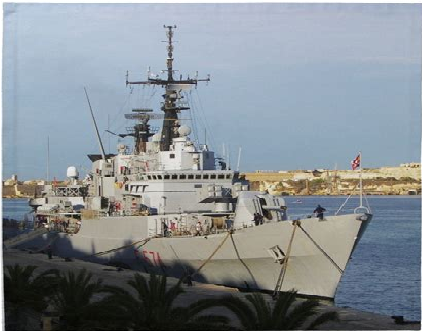
Frigate in Malta.