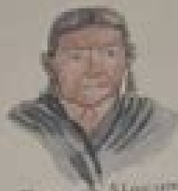
For a complete list of authors, see page 201.