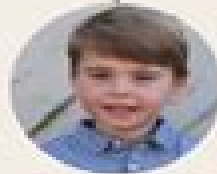
Princes Louis of Cambridge