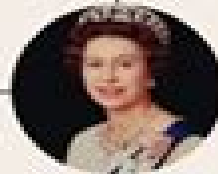
Queen Elizabeth II