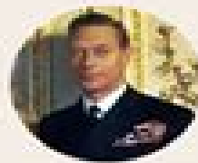
King George VI