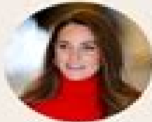
Catherine Duchess of Cambridge