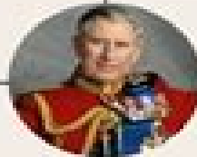
Charles Prince of Wales