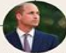
Prince William Duke of Cambridge