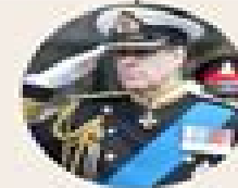
Prince Andrew Duke of York