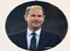
Prince Edward Earl of Wessex