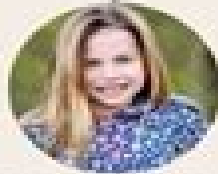
Princess Charlotte of Cambridge