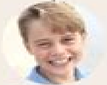
Prince George of Cambridge