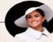
Meghan Markle Duchess of Sussex