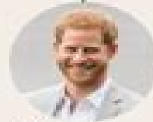
Prince Harry Duke of Sussex