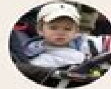
Archie Harrison Mountbatten-Windsor