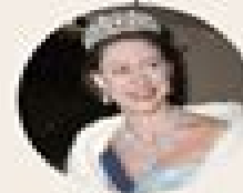
Princess Margaret Countess of Snowden