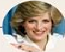
Diana Princess of Wales