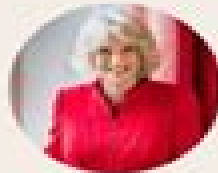
Camilla Duchess of Cornwall