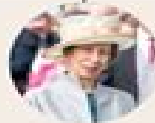
Anne Princess Royal