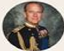
Prince Philip Duke of Edinburgh