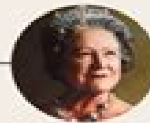
Queen Elizabeth The Queen Mother