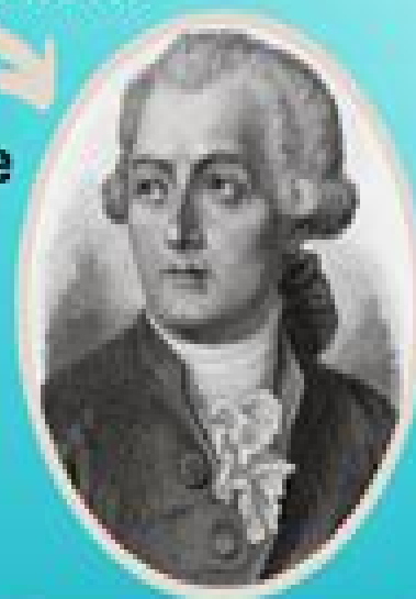
Antoine-Laurent Lavoisier proved combustion does not change mass