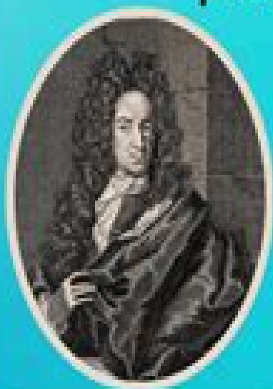
Georg Ernst Stahl proposed phlogiston theory

Flammable materials contain a fire-like element called phlogiston that is released during combustion.