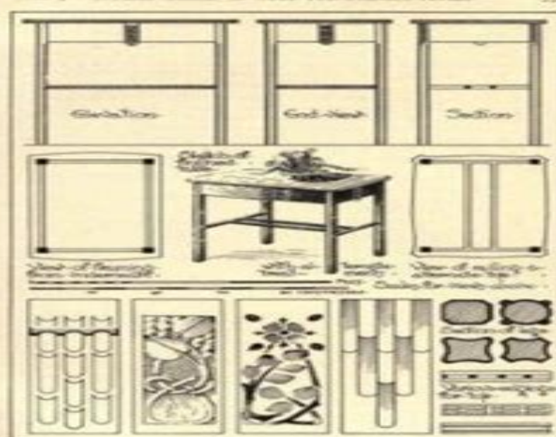
FIG. 22.—The square table.