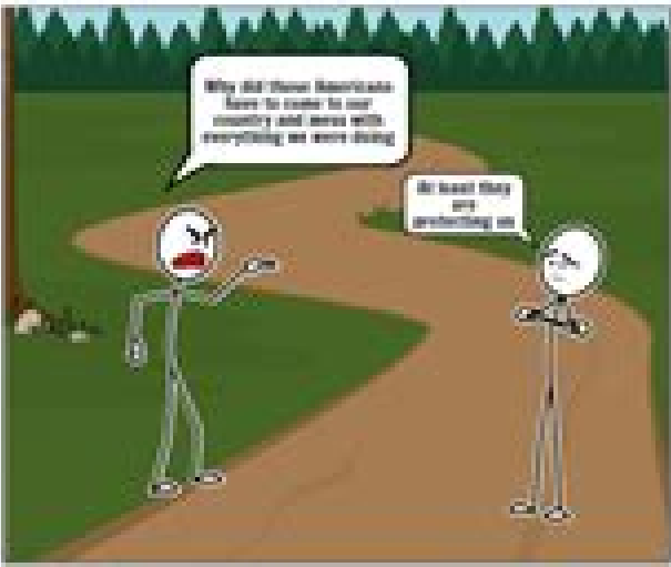
Protectorate is where the mother country protects its states as well as territories.