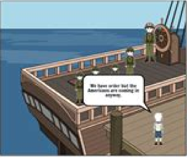
The Platt Amendment only allowed the Americans to interfere if there was chaos in Cuba. They invaded anyway.