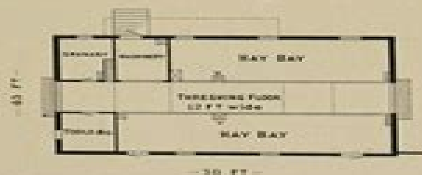
PRINCIPAL FLOOR PLAN OF MAIN BARN