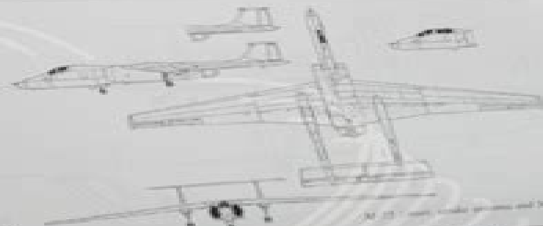
© 2005 The Authors Journal compilation © 2005 Blackwell Publishing Ltd