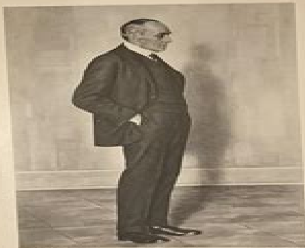
CARL E. AKELEY